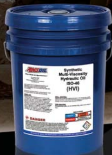
SYNTHETIC HYDRAULIC OIL