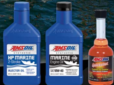
SYNTHETIC 2-STROKE OIL