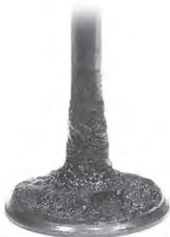
Intake Valve before P.i. Treatment