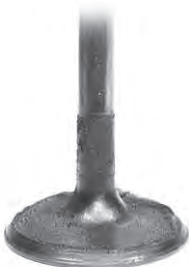
Intake Valve after P.i. Treatment